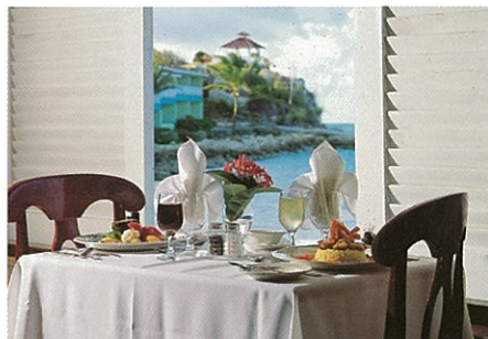
Dining is an elegant experience at Tradewinds.

Accommodations: 180 rooms housed in one-, two-, and three-story buildings, with striking views of the lush gardens or the ocean.