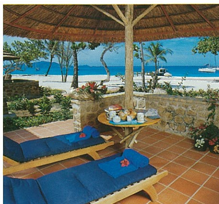
Lounge by the beach in your own private cabana.