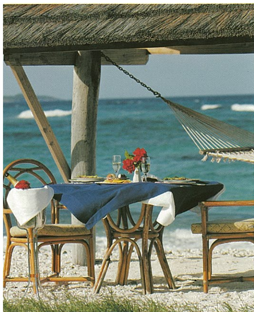
Enjoy a romantic alfresco lunch on the beach.